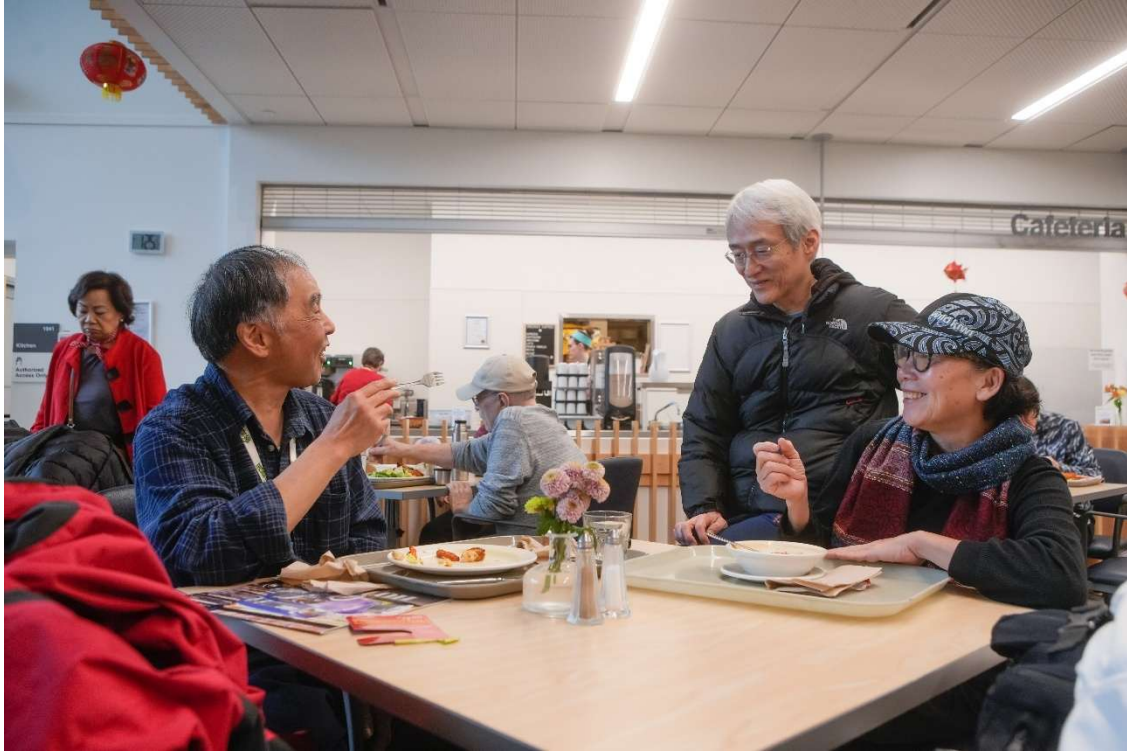
Photo: Patrons chatting and enjoying a lovely meal from the Seniors Centre Cafeteria.